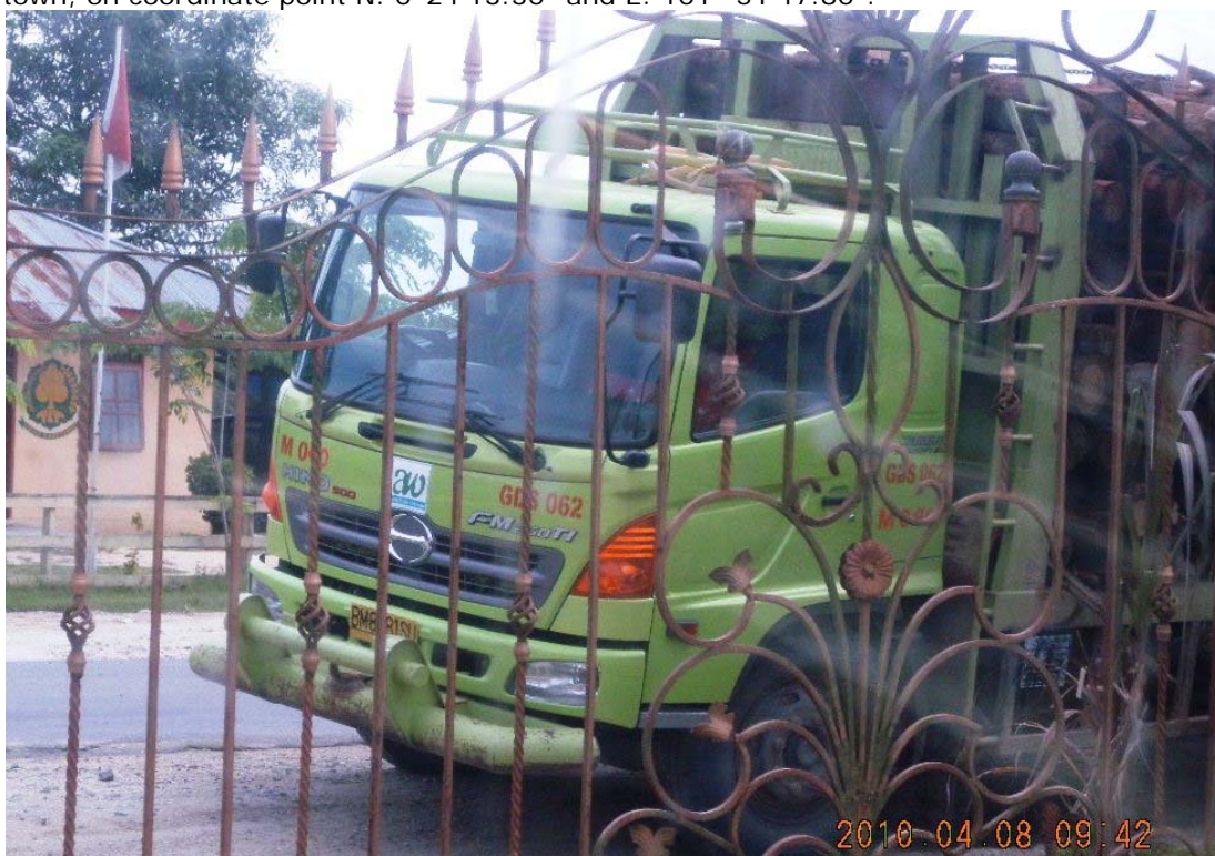
Photo 6. At 09:42 a.m. on 8 April 2010, the truck number BM 8581 SU stopped in Check Point of Forest Production run by Pelalawan District Forestry Service on coordinate point N. 0°28'7.10" and E. 101° 35'24.98".