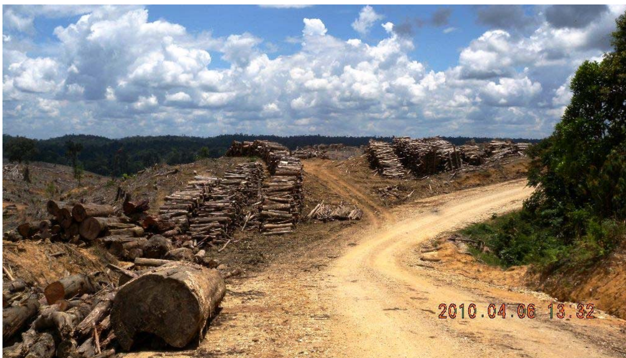
Photo 1. Logging site in concession of PT Artelindo Wiratama, APP's affiliated pulpwood company on coordinate point S. 0 45.77610 E. 101 51.74640, where it is estimated that 2,000 hectares of natural forest in Bukit Tigapuluh block converted into acacia plantation.