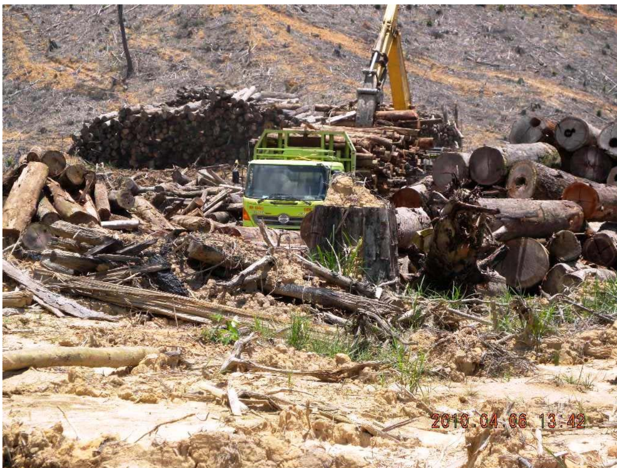
Photo 3. At 01:42 p.m. on 6 April 2010, the logging truck with number BM 8581 SU were loading logs felled from natural forest by an excavator with Komatsu brand and identity number H 12. The loading site is on coordinate point S. 0°45'51.77" and E. 101°51'41.90".