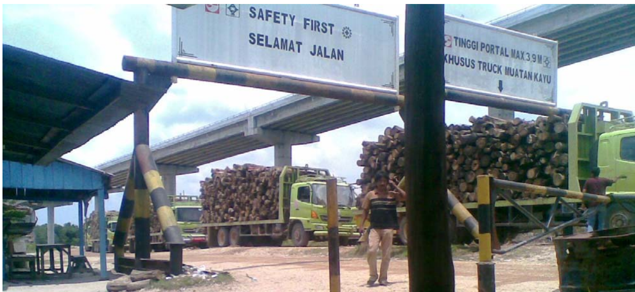
Photo 7. At 11:58 a.m. on 8 April 2010, the truck number BM 8581 SU arrived at pontoon ferry port in Siak River that run by PT Arara Abadi, APP's timber supplier, on coordinate point E. 101^{\circ}36'07.56'' and N. 0^{\circ}37'7.6''