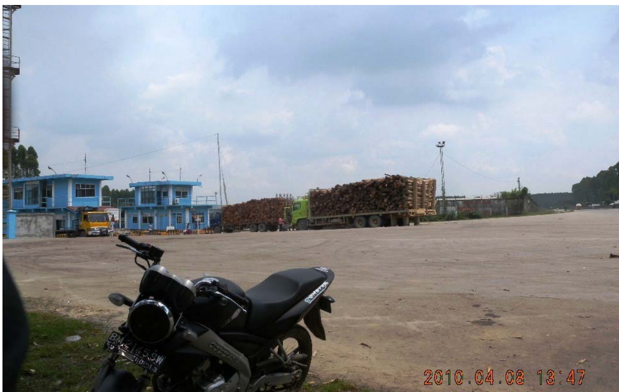
Photo 8. At 01:47 p.m. on 8 April 2010, the truck number BM 8581 SU arrived and entered the gate of PT IKPP Perawang pulp mill on coordinate point E. 101^{\circ}36'42.03'' N. 0^{\circ}41'32.98''