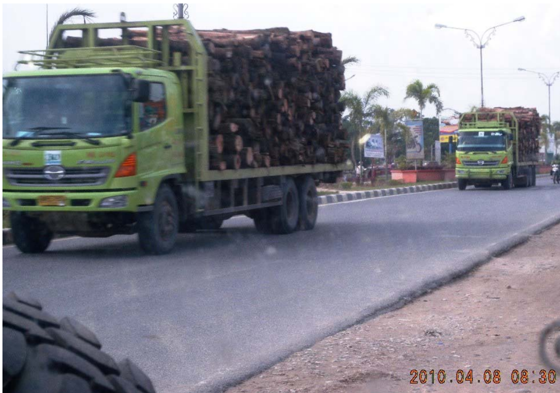
Photo 5. At 08:30 a.m. on 8 April 2010, the truck number BM 8581 SU passed Lintas Timur road in Pangkalan Kerinci town, on coordinate point N. 0°24'13.30" and E. 101° 51'47.80".