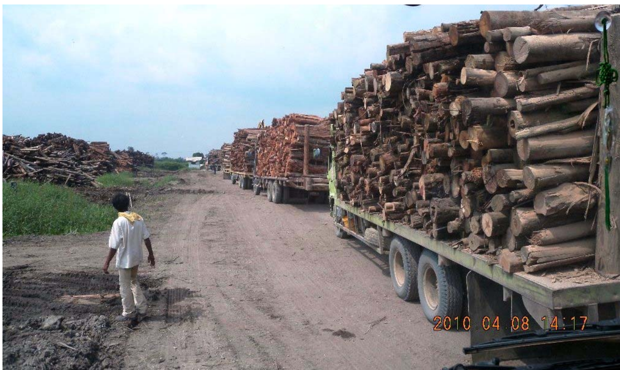
Photo 10. At 02:17 p.m. on 8 April 2010, the truck number BM 8581 SU in line to unload its logs in logyard C43 at PT IKPP Perawang pulp mill on coordinate point E.101°38'2.83" N. 0°41'32.95"