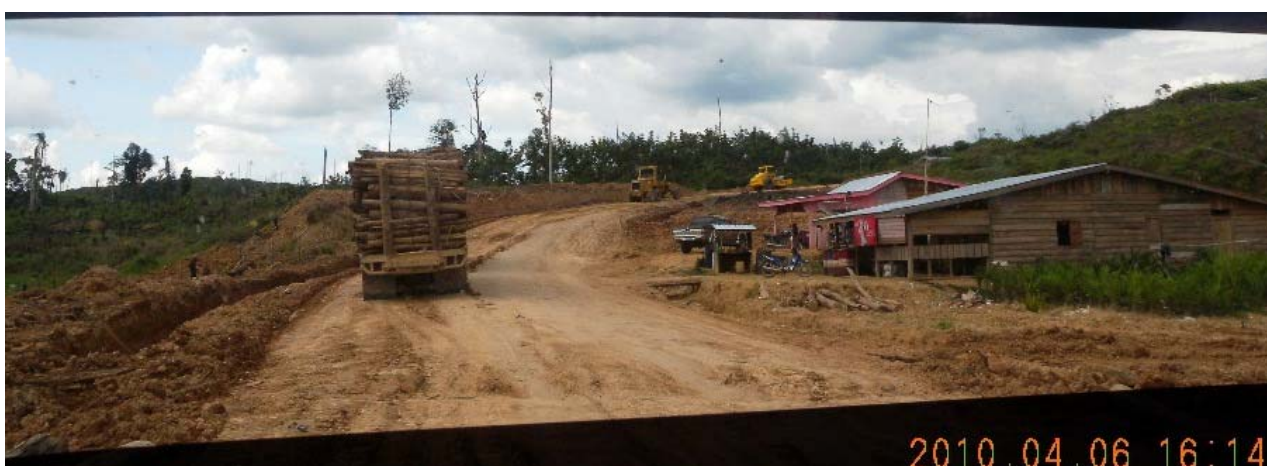
Photo 4. At 04:14 p.m. on 6 April 2010, truck number BM 8581 SU stopped at a stall in the edge of Kelawaran River on coordinate point S. 0°49'38.47" and E. 101° 57'28.79".